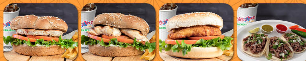
TURKEY BURGER 12.35 CHICKEN BREAST SANDWICH 15.80 CRISPY CHICKEN 13.99 TACO SPECIAL 12.20