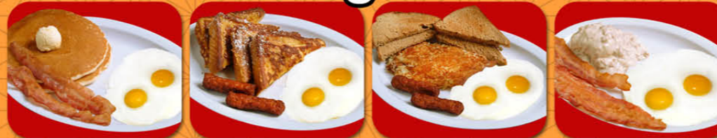
PANCAKE & EGGS FRENCH TOAST HASHBROWN & EGGS COUNTRY STYLE