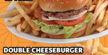
DOUBLE CHEESEBURGER W/ FRIES