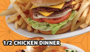
1/2 CHICKEN DINNER