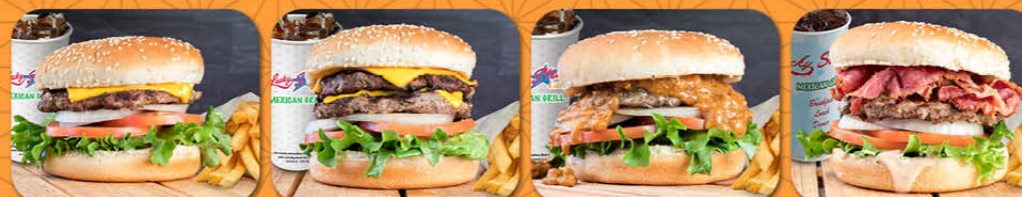
CHEESEBURGER 11.45 DOUBLE CHEESEBURGER 14.30 CHILI BURGER 12.60 PASTRAMI BURGER 13.85

YOUR CHOICE TO SUBSTITUTE FRIES FOR SALAD, FRUIT CUP, WHOLE WHEAT TOAST, VEGETABLES, BEANS OR RICE.