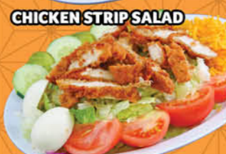
CHICKEN STRIP SALAD