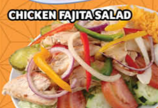
CHICKEN FAJITA SALAD